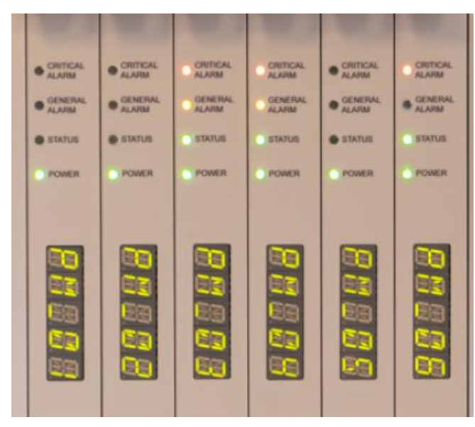
Figure 2 Critical alarm indication using LEDs on IO PCA.

Number T12660 revision 0 Project number 2546746 Page 5 of 10