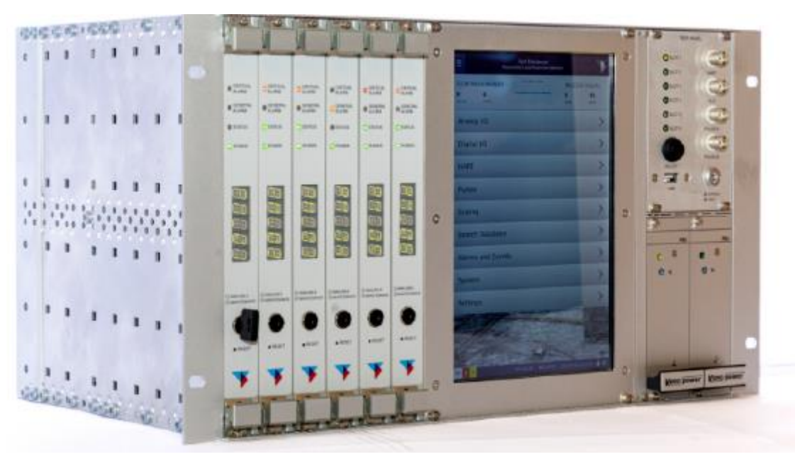
Figure 1 Example of the EVCD

The EVCD can be connected to any gas meter which has a pulse output with characteristics as described in paragraph 1.5.1.