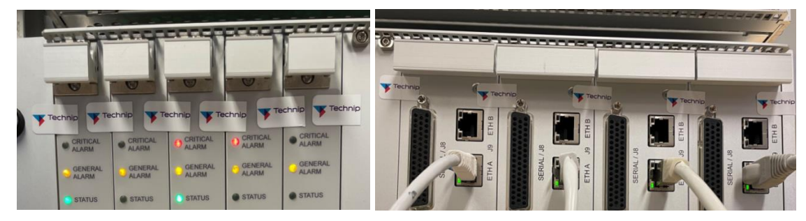
Figure 7 Example of sealing of Expansion IO PCA front side (left); back side (Right).

Figure 6 Sealing of name plate, sealing of expansion IO PCA front side, sealing of physical securing key using sealing stickers.