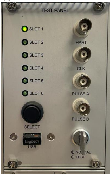
Figure 5 Selection key to display multi stream slots.

The EVCD may be constructed such that up to 6 separate IO PCA units could be attached to it. Each IO PCA holds a separate expansion IO slot and can operate up to 3 streams simultaneously. By pressing the "Select" button beside the display it is possible to toggle through the different IO PCA units. The LED lights above the "Select" button highlights exactly which IO PCA is being displayed. The inscription nameplate attached to each IO PCA displays the assigned SLOT number.