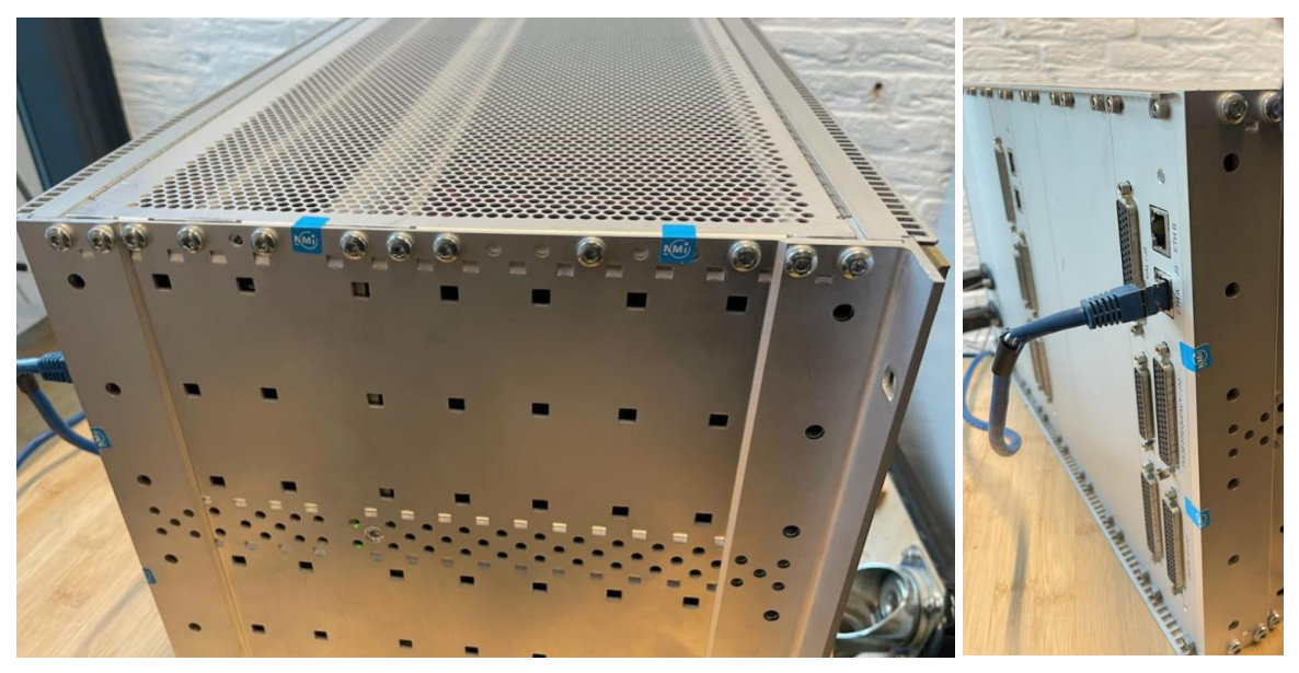
Figure 8 Example sealing of Sigma<sup>3</sup> against opening using sticker seals from back and sides.

Number T12660 revision 0 Project number 2546746 Page 10 of 10