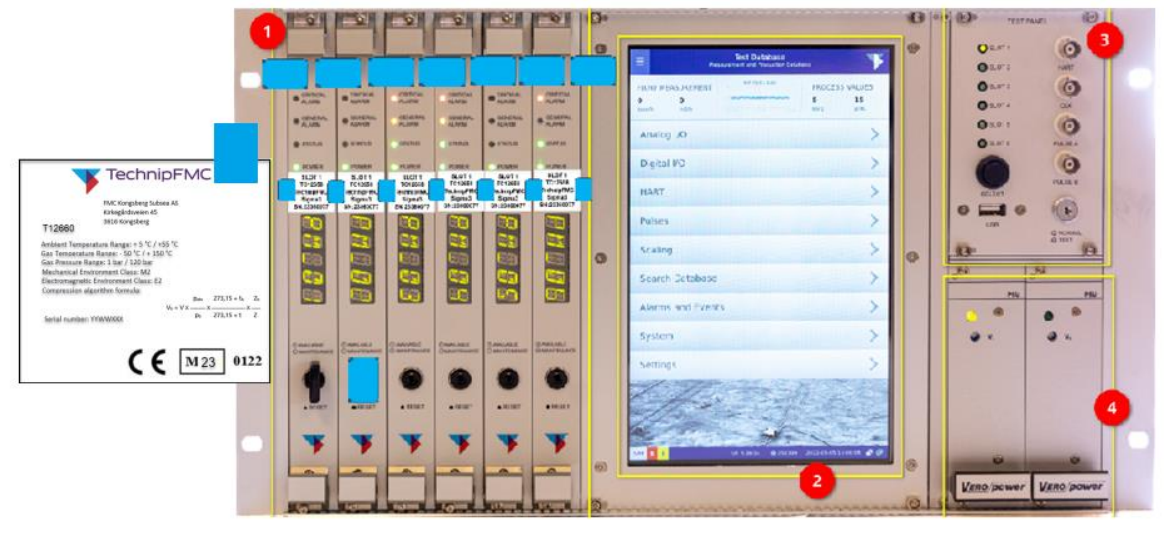
Figure 6 Sealing of name plate, sealing of expansion IO PCA front side, sealing of physical securing key using sealing stickers.

See below for an example of the sealing positions.